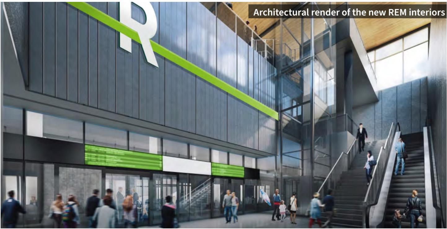
1 REM_Station_intérieur.